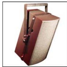
FC-121v FLYING CRADLE