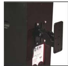
POWERDRIVE WHH100 WALL BRACKET