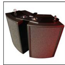
DFB-121 DUAL FLYBAR