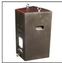
M10 FORGED SHOULDER EYEBOLTS