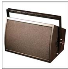
FC-121h FLYING CRADLE